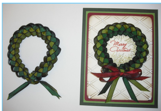
The finished piece.

Trim the ends to a nice length and then add a small bow made from a red ribbon. Attach with sticky glue dots. To attach your finished wreath to your card, use double sided sticky cushion cut into small pieces and attached to the underside of the wreath.